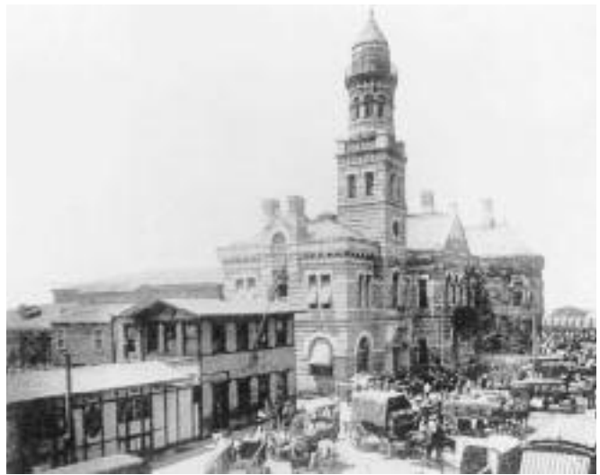
New York ferry terminal

During the first years, immigration was handled directly by the federal government only at New York City. At other ports of entry it continued to be handled by local authorities under contract to the United States government. By 1892, however, all immigration fell into the hands of federal officials because people were becoming