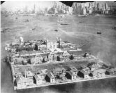
Aerial view of Ellis Island