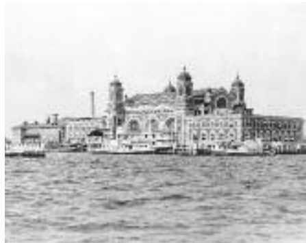
New building opening in 1900