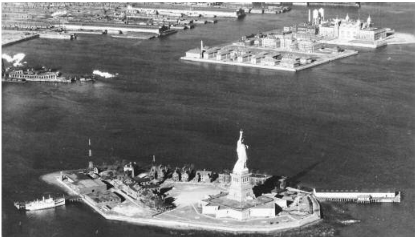
Aerial view showing Ellis Island (top right) and the Statue of Liberty (bottom).