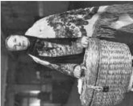
Lithuanian woman with shawl