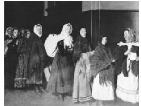
Waiting on the dock