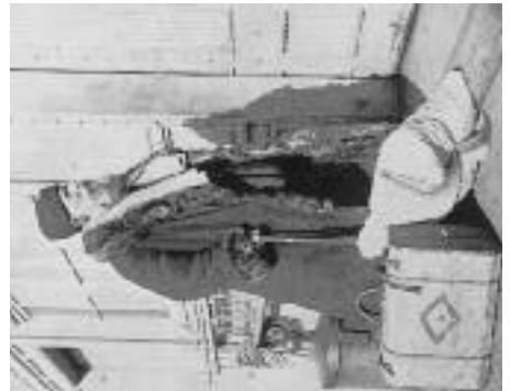
Unidentified man, 1900