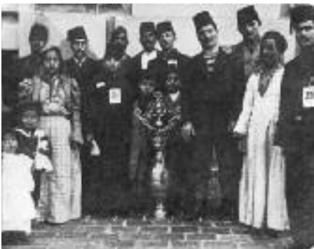
Immigrants wearing fezzes