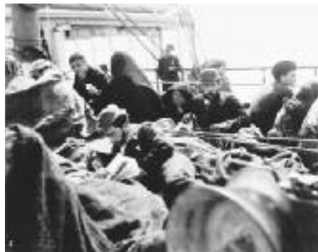
Steerage passengers on deck