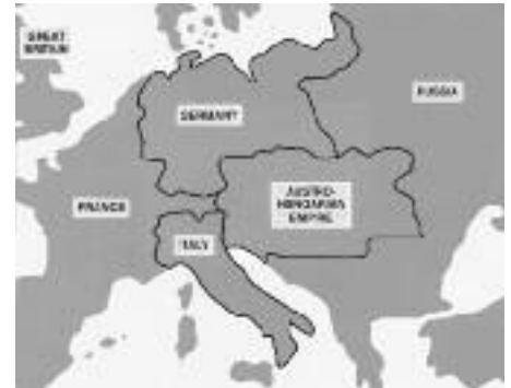
Major nations in peak wave