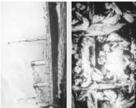
Steamship and steerage passengers