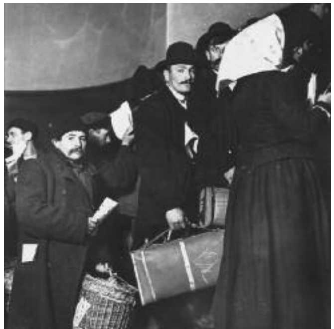
Immigrants going to the second floor for medical examinations and interrogations

In 1909 Williams tried to enforce the laws strictly. To reduce the flow of immigrants and prevent them from