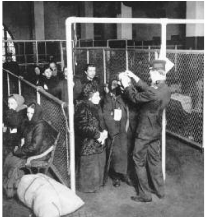
Inspectors examining the eyes of immigrants

Although 80 percent made it through the first day, some were detained until a friend or relative provided sufficient money for them to leave. These people were mostly women and children, and they seldom waited more than five days. At the end of that time, if they had not been sent funds, the detainees were turned over to one of the societies or were deported.