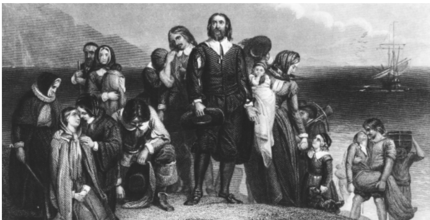
The arrival of the Pilgrims at Plymouth

The hardships suffered in Virginia taught the English colonists important lessons. The region of America they had reached could offer prosperity, but not if it were just the site for outposts coordinating the exploitation of local labor and resources. The colonists had to be willing to establish self-supporting communities of people farming and performing the other ordinary tasks done in the villages and towns of Europe. Indeed, some people might even earn riches by providing—not only for nearby but also for faraway markets—tobacco, rice, fish, furs and other products that could be grown or found more easily in America than in Europe.