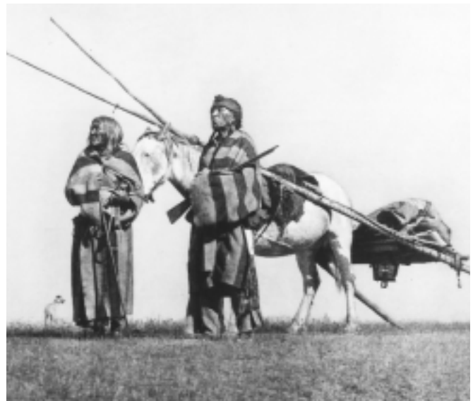
The acquisition of the horse increased Native Americans' ability to migrate.

The Indians of the Plateau relied on exploiting their salmon-rich rivers, hunting and gathering. Like the Basin's Shoshone, Utes and Northern Paiutes after the introduction of the horse, many Plateau tribes began venturing onto the Plains to hunt the bison. Exploitation of a rich ecosystem and a dense population characterized the Northwest Coast, where food supplies were generally abundant from sea and land. An environment less hospitable was typical of the Arctic regions, where Aleuts and Inuit (Eskimos) thrived as skilled fishermen and sea-mammal hunters.